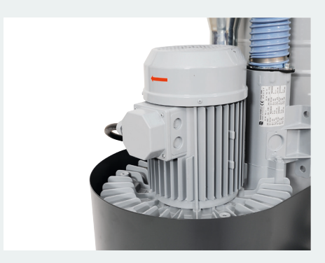
Blower: silent and reliable