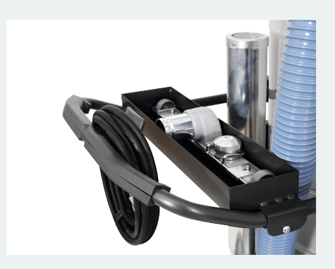
Cable holder and accessory box: functional