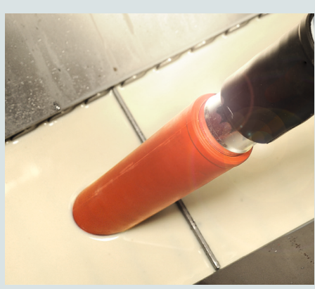
Suitable also for ceramic sector