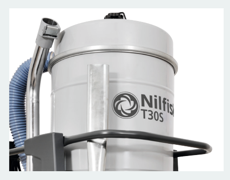
Handgrip holder: all the accessories are close to the operator