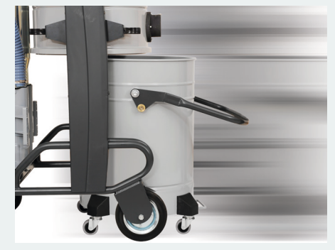
Container with castors and handle: practical