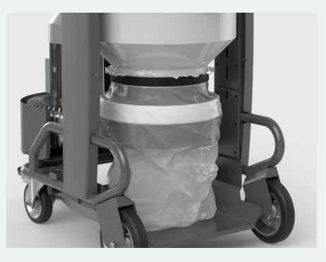
Gravity unload system with Longopac®