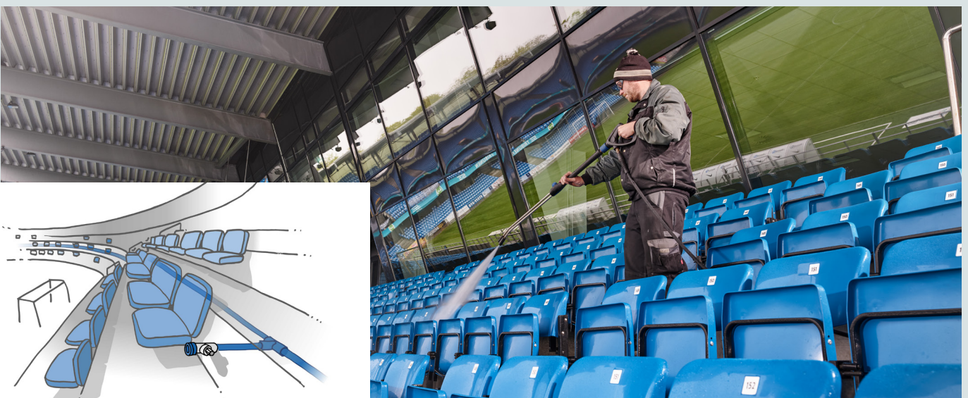
Cleaning of spectator area and seats in a stadium. Cleaning the spectator area after a game or an event can be difficult. In this example the stationary high pressure washer system (SC DELTA) enables multiple operators to clean fast and efficiently at the same time