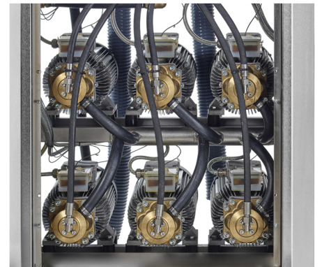
Easy service and maintenance: Time-saving access to motor pumps and other vital parts from top or front of the machine