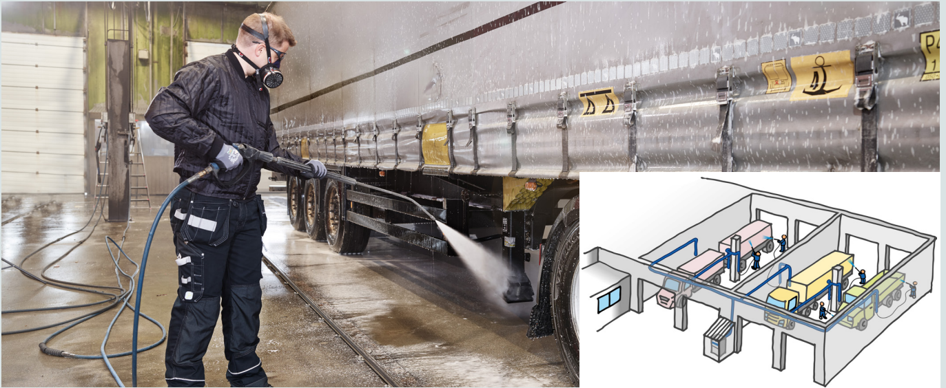
Large trucks wash area. Main applications being truck wash, pre-wash & cleaning of hard to reach areas as well as cleaning the inside of trailers. This company has 4 wash bays with up to 6 operators working simultaneously