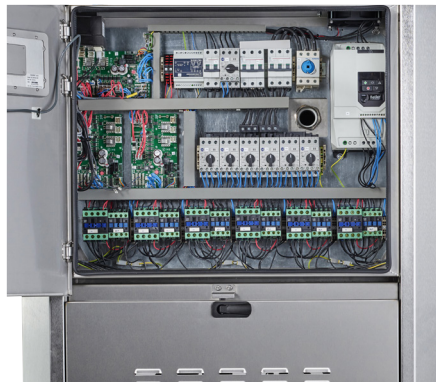
Convenient: Advanced pump management system with start/stop control