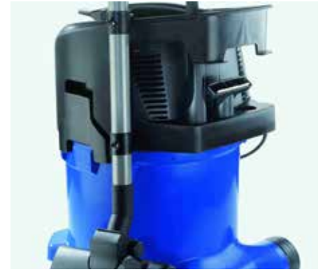
The design lets you have your accessories on hand in a secure way.